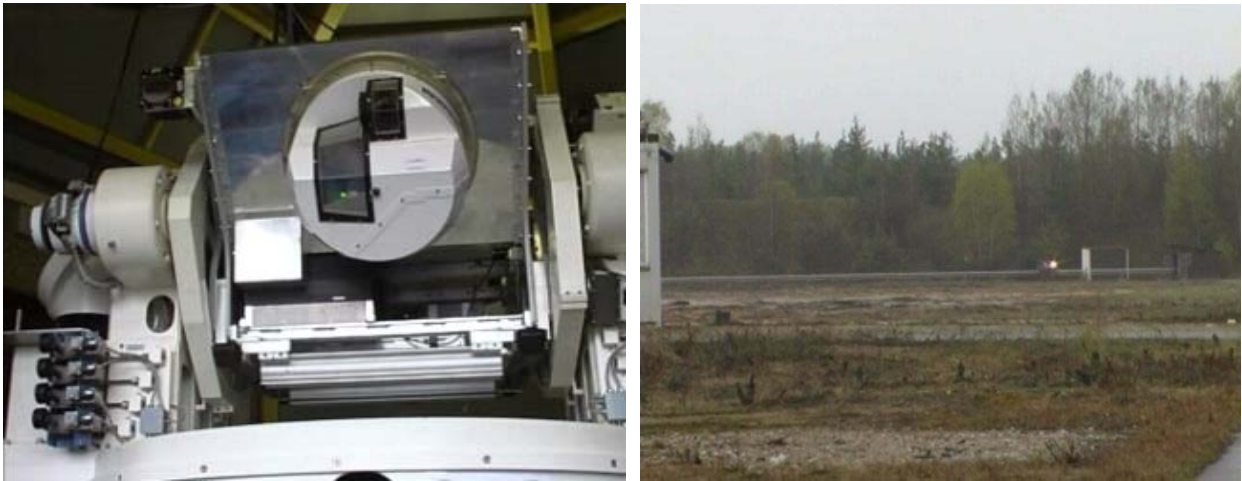
Figure 3 Moving Platform (left), Moving Target (right)

The ground tests comprise of the following tests: