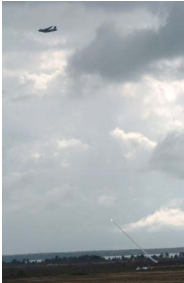
Figure 7 SIDEMIR firing at C160