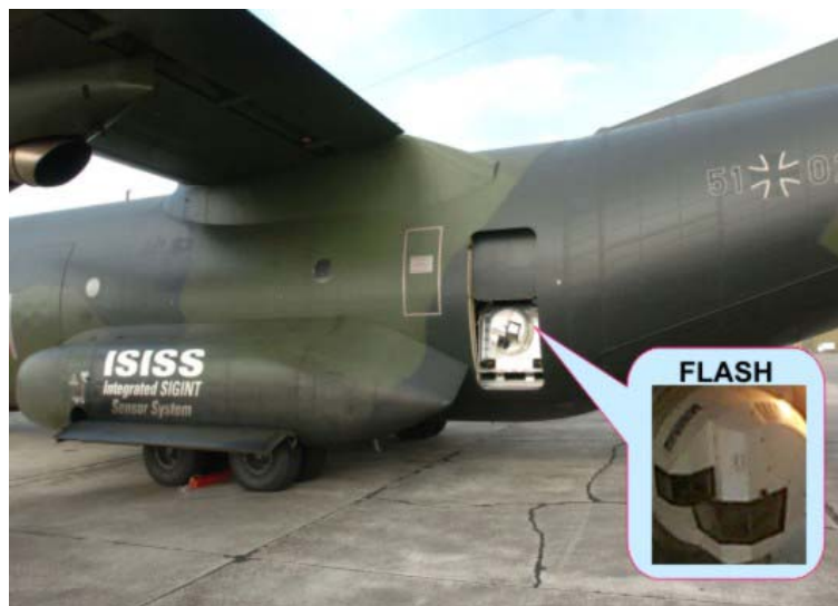
Figure 5 FLASH mounted on C160 (Transall)

After integration into the C-160 aircraft and ground test, the transition flight from WTD61, Manching to CEL, Cazaux was performed with the system onboard.