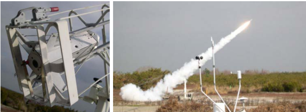
Figure 6 SIDEMIR Missile Simulator

After the test runs with the static sources, the trials with SIDEMIR began. SIDEMIR is an unguided test rocket simulating a typical SAM signature, duration of boost and kinematics. For the dynamic trials SIDEMIRs were fired when in the FOV of the MWS and the field of regard of FLASH, with an elevation angle pointing at the aircraft and an azimuth angle ahead of the aircraft. Shortly after burnout, the SIDEMIR airbrakes activated automatically to prevent it from hitting the aircraft.