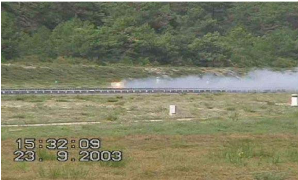
Figure 4 Sledge Missile Firing

In addition a series of missile sledge firing tests at the test range of CEL (Biscarosse, France) to validate the passive tracking part of FLASH for different missiles' propulsions (Figure 4 ).